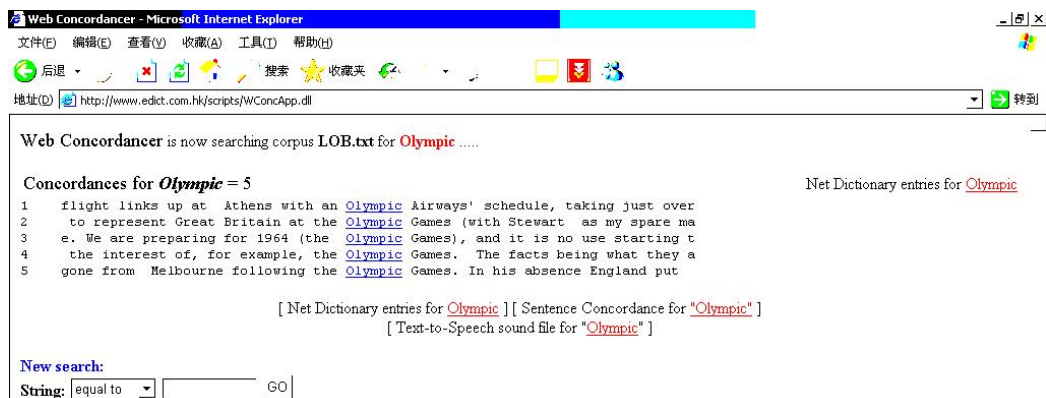
(Figure 2: Word Olympic displayed on online LOB. See

http://www.edict.com.hk/concordance/WWWConcappE.htm )